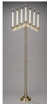
F ~ Candelabra