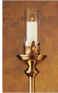
B ~Pew Candles