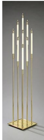
D ~ Floor Candles