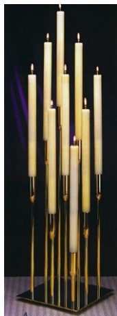
E ~ Altar Candles