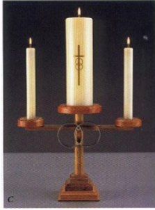
A ~Unity Candle