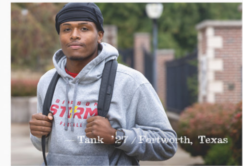
Tank '27 / Fortworth, Texas